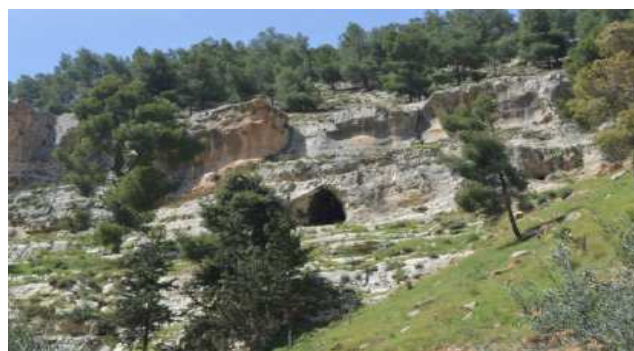
Figure 2. Represents of the famous cave in the Wadi Al-Quf, which has inside Nursery Reserve west of the north of Hebron.