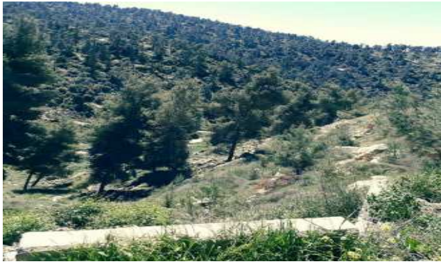
Figure 3. An image representing part of the plants in the Wadi Al-Guf Nursery Reserve.