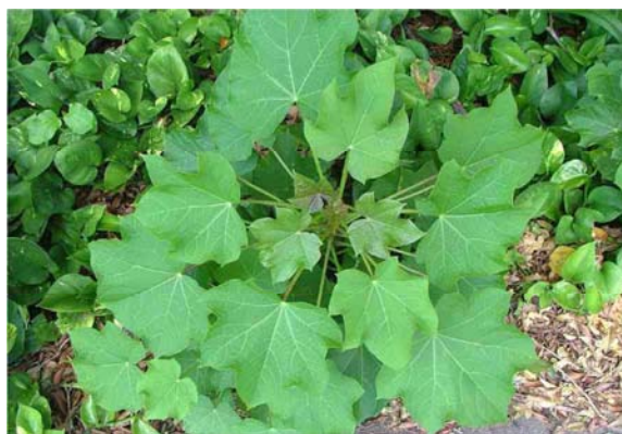
Figure 1. Jatropha curcas .

Thus the present study was aimed to identify the antibacterial efficacy of Jatropha curcas leaves extract against streptococcus mutans , a cariogenic microorganism.