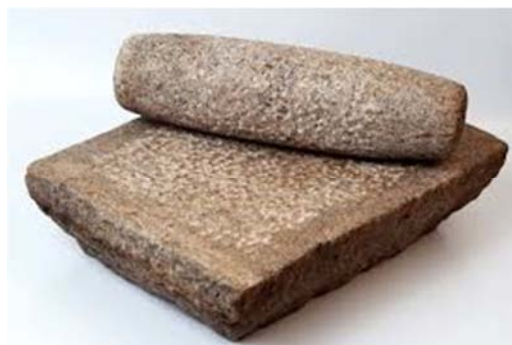
Figure 3. Grinding stone.

100 ml of Muller-Hinton agar was sterilized and poured into sterile petri plates in the laminar chamber and allow to solidify. 100µl of the cultures were spread onto the plates using a spreader. 5 wells were punched on each plate using a 5 mm megabore for four different sample concentrations. 50µl of the dilutions were pipetted into the wells and all the plates were incubated at 37°C overnight. The zone of inhibition was observed and the diameter of the zone was recorded.